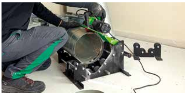
Time-saving cutting of ventilation pipes