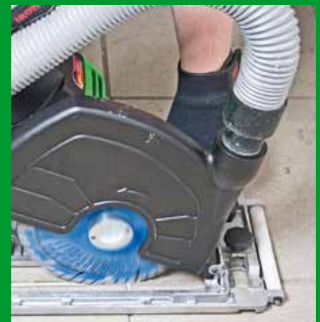
Joint milling here: dry cutting with depth limiting