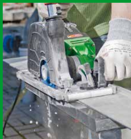
Cutting to length of natural stone worktops here: wet cutting with guide rail