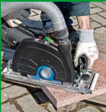
Artificial stone – terrace slabs here: dry cutting