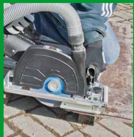
Concrete curbs in gardening and landscaping here: dry cutting