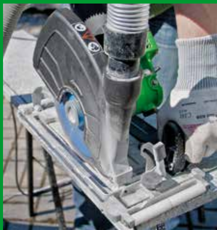
Natural stone window sills – milling of joints here: dry cutting with depth limiting