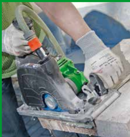
Reduce natural stone riser here: wet cutting with angle stop

Angle stop – simple cutting independent of the workpiece size