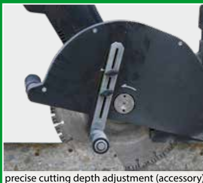
precise cutting depth adjustment (accessory)