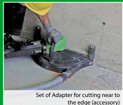
Set of Adapter for cutting near to the edge (accessory)