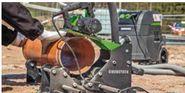
Cutting and chamfering in one step