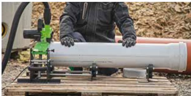
Align the tube horizontally and vertically exactly to the saw blade