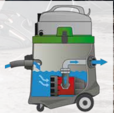
EPS 50 functional schematic