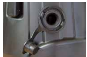
C-pipe connection for wastewater

Elektrowerkzeuge GmbH Eibenstock Auersbergstraße 10 D-08309 Eibenstock