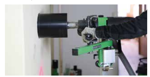
Core drilling for the chimney connection

Elektrowerkzeuge GmbH Eibenstock Auersbergstraße 10 08309 Eibenstock