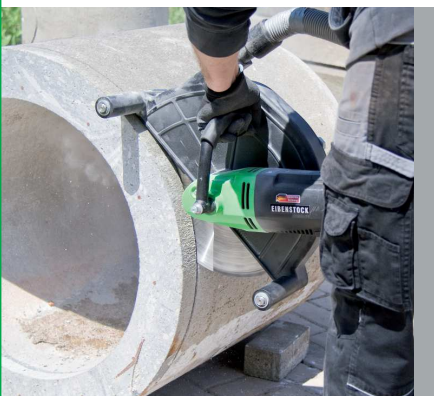
precise cutting depth adjustment (accessory)