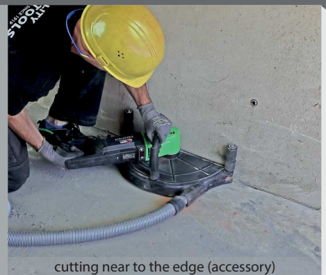
cutting near to the edge (accessory)