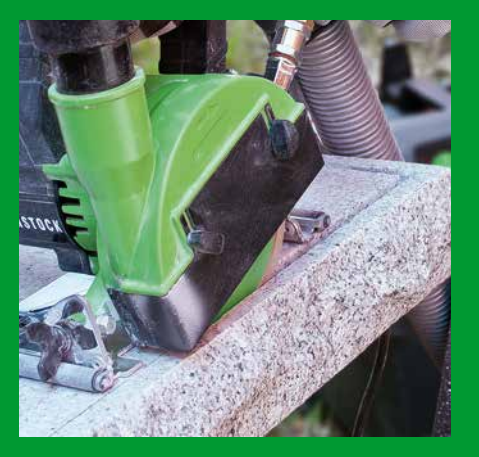
milling of joints with diamond milling disc – depth limiting and immersion function