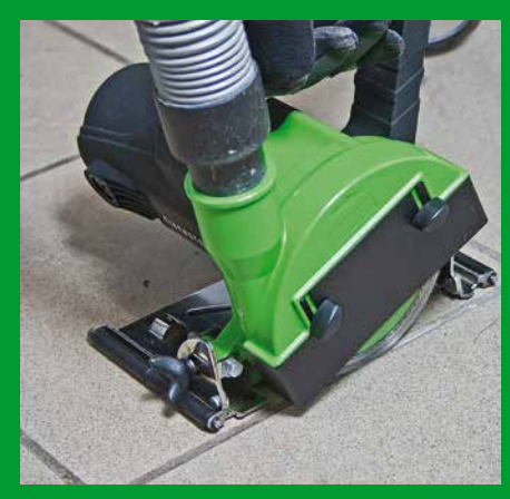
Joint milling – dry cutting with depth limiting and immersion function