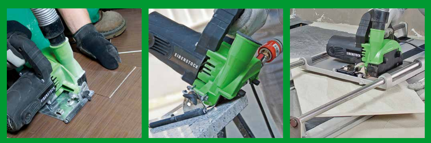
Cutting of tiles and cutouts in tiles

By connecting Eibenstock industrial vacuum cleaners on the 35 mm connection hose, the dust is reduced to a minimum and it will thus ensure better prevention against harmful mineral dust to the user.