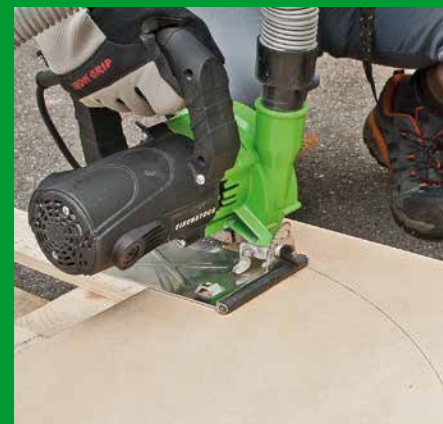
Curved cuts with diamond concave disc